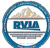
RVIA Park Model Label (oldest units) RPTIA Park Model Label (older units) RVIA Recreational Park Trailer Label (new units)