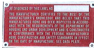
HUD Manufactured Housing Label